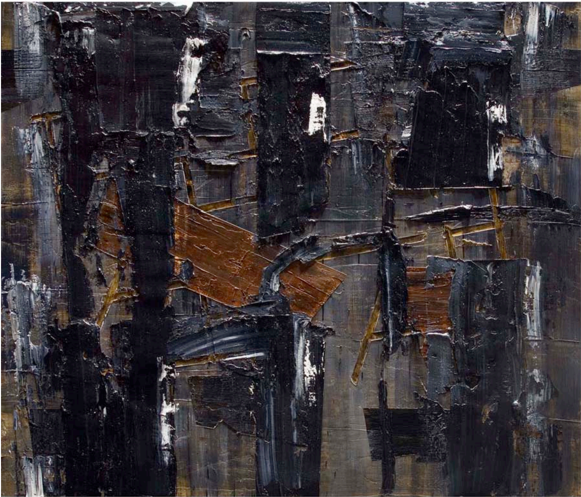
Włodzimierz Książek, 2007, oil on canvas, 68"X 80" (173 X 203cm)

Slides from Jerusalem with its wailing wall and Al-Aqsa Mosque and other images from Israel, such as the ruins of Masada, remains of archeological sites from the Negev desert, West Bank, Upper Galilee, as well as pictures from the destroyed Palestinian villages are examples of archeological excavation, historical excavation, tradition, and its role in the context of time, the relativity of freedom, and authenticity.