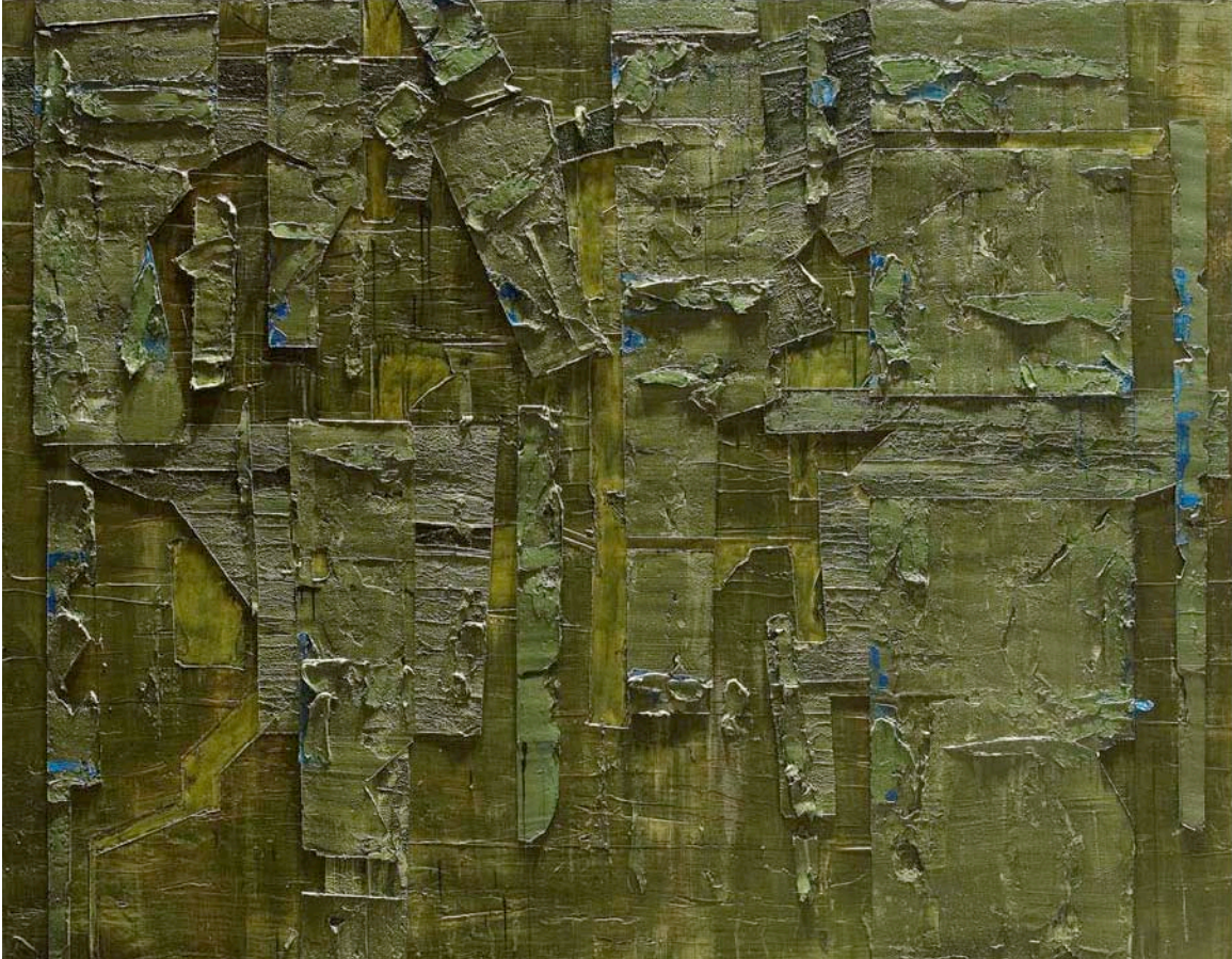
Włodzimierz Książek, 2007, oil on canvas, 80" X 90" (203 X 229cm)

“In short, the history of thought, of knowledge, of philosophy, of literature seems to be seeking, and discovering, more and more discontinuities, whereas history itself appears to be abandoning the irruption of events in favour of stable structures.[1]”